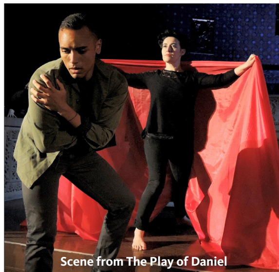
Scene from The Play of Daniel